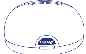
LTI-WiFi Not Included