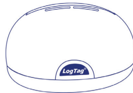
LTI-HID Not Included